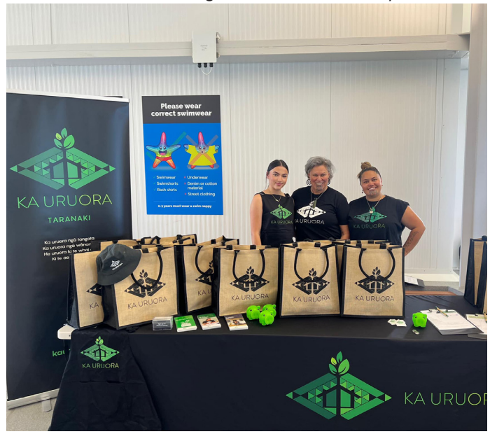
SuperLife kaimahi joining our team at Taranaki Tū Mai 2023

Taranaki kaimahi at the Ngāruahine Whānau Day